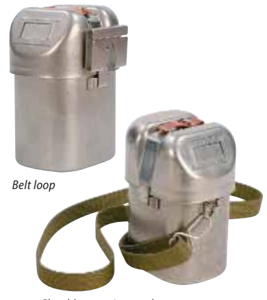
Shoulder carrying mode